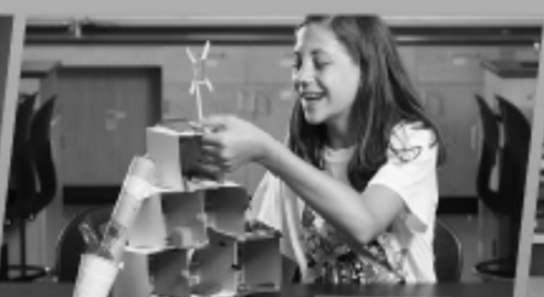
Design futuristic dream homes with smart furniture and smart energy.