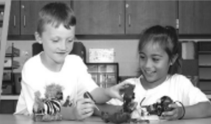
Build and personalize a robotic dog and compare the inner mechanics to the biology of living animals.