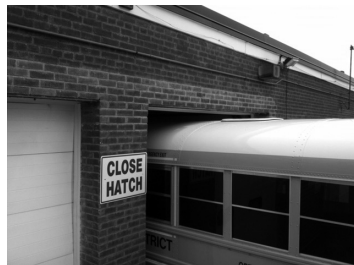
Our outdated bus garages are too low to accommodate our modern bus fleet