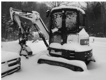
Without adequate storage space, our maintenance department stores expensive equipment outside, exposed to rain and snow.