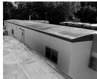
We currently rent trailers to house our transportation staff, lease space for our receiving department, and rent space on Tucker Drive to repair our buses safely. Eliminating these rentals will save more than $127,000 a year.