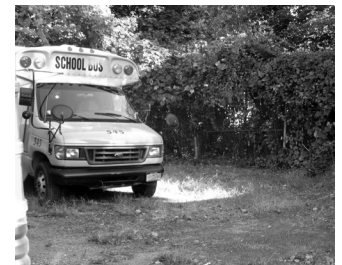
Paving the parking lots will slow down the effects of rust on our buses, extending the life of our fleet.