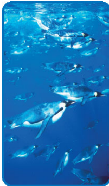
Doug Allan Emperor penguins dive underwater to swim.

What is black and white and wet all over? A penguin going for a swim! Penguins are birds. They have feathers and lay eggs. Unlike most birds, penguins don't fly. They use their wings as flippers. Penguins flap their flippers to swim underwater. Their webbed feet help them steer.