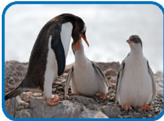
A gentoo penguin feeds its chicks.

On land, penguins walk with a waddle or a hop. They often slide on their bellies to travel over ice or snow. They use their flippers and feet to help them slide.