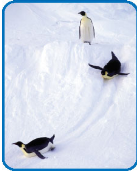
Daniel Cox Emperor penguins slide on their bellies across the snow.

On land, penguins walk with a waddle or a hop. They often slide on their bellies to travel over ice or snow. They use their flippers and feet to help them slide.