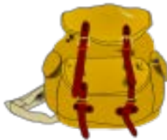
in a backpack