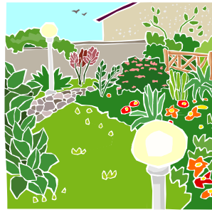
in a garden

3. Which animal likes to eat sunflower seeds?