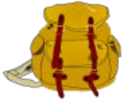
in a backpack