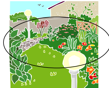
in a garden