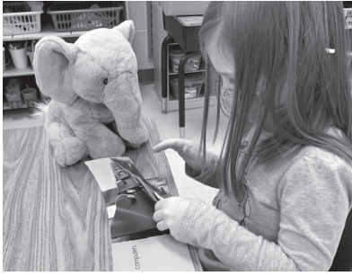
This Vail Farm kindergartener learns to read with the help of her elephant "reading buddy."

Students must be 5 years old by December 1, 2021 to register for kindergarten for the 2021/2022 school year.