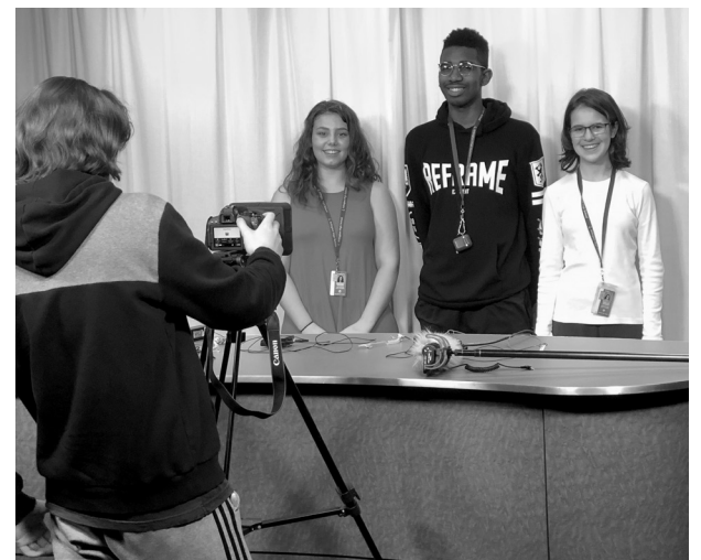
One of the AHS Student Equity Team initiatives was to create a 6-part PSA campaign for the AHS morning announcements.

Each middle school and Arlington High School has a student equity team. Student leaders educate their peers, as well as share their experiences and perspectives with school faculty and staff. The high school and middle school equity teams meet quarterly with the NYU Metro Center. The Arlington High School Student Equity Team, a group of over 60 students, meets after-school once a month. One