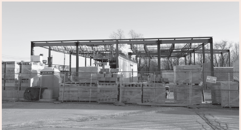
Construction is underway for the new lift bays at the LaGrange bus garage.

In 2018, we asked voters to approve a proposition for improvements to the athletic facilities and bathrooms at Arlington High School. To date, the turf on the Maroon and Gold Fields has been replaced and turf has been added to the softball infield. The track has been resurfaced. The new visitor bleachers and press box have been installed. The wiring for the press box is scheduled to be completed in May. We will be bidding for the bathroom renovations this spring. •