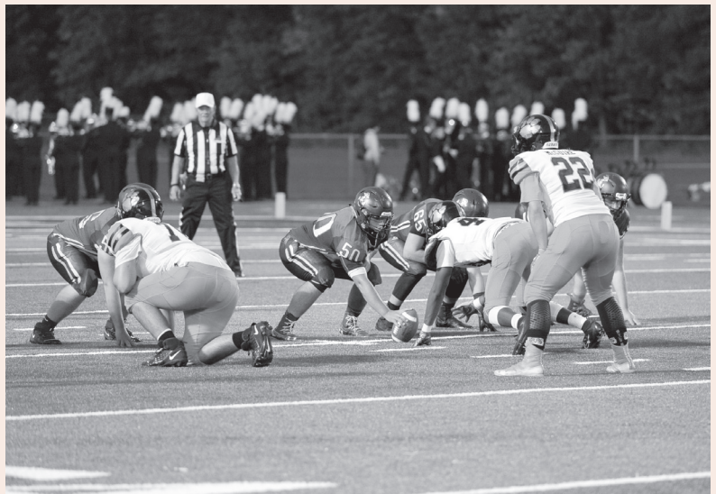
The turf was replaced on the Maroon and Gold fields to protect the safety of our student athletes.